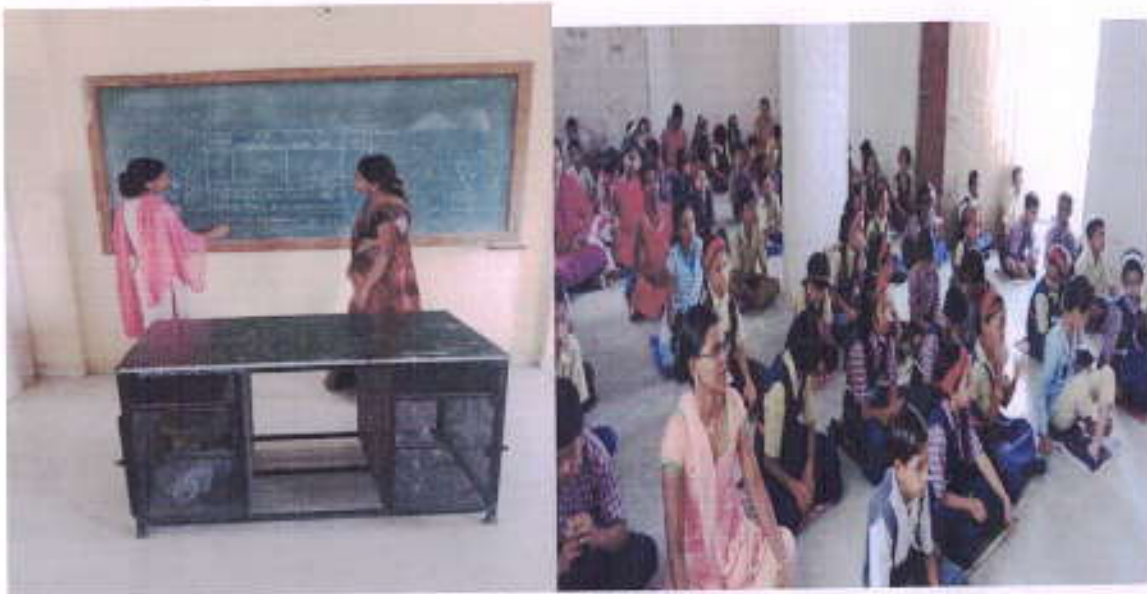
Teaching Tribal Students