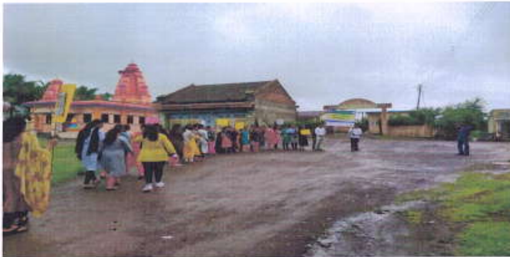
AIDS awareness Rally