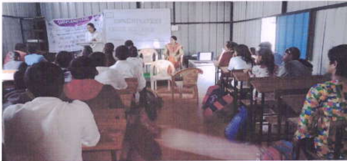
Concentration and Career Guidance