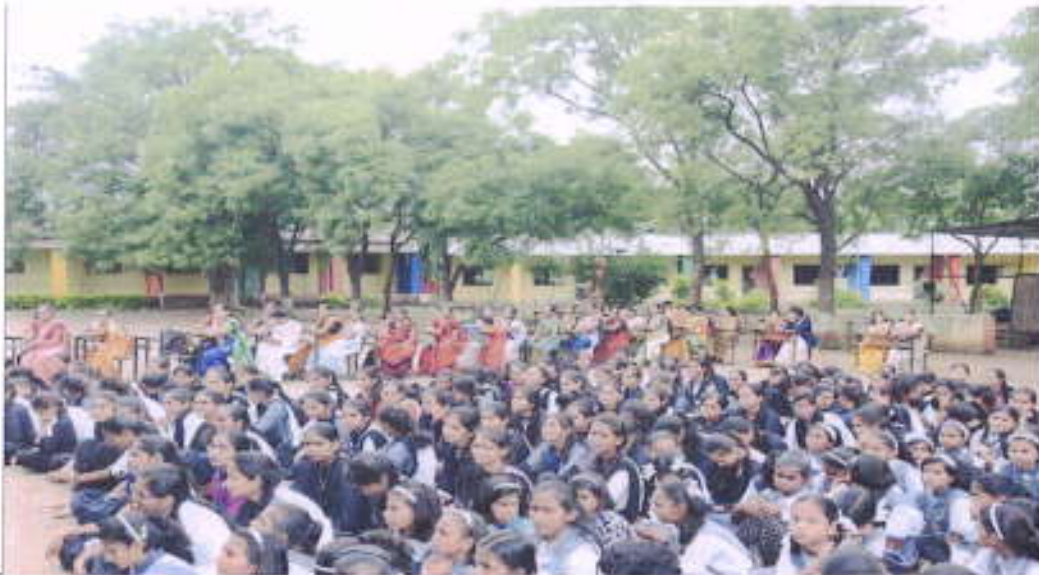
Health and hygiene Guidance for Girls