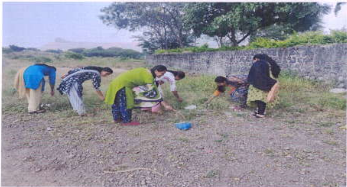
Cleanliness Campaign at Kaplidraswer temple