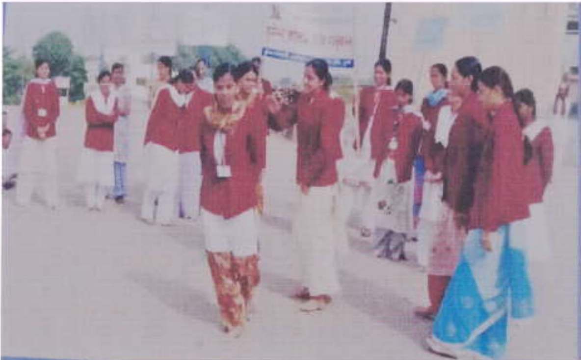
Rashtriya Ekta Diwas Street Play