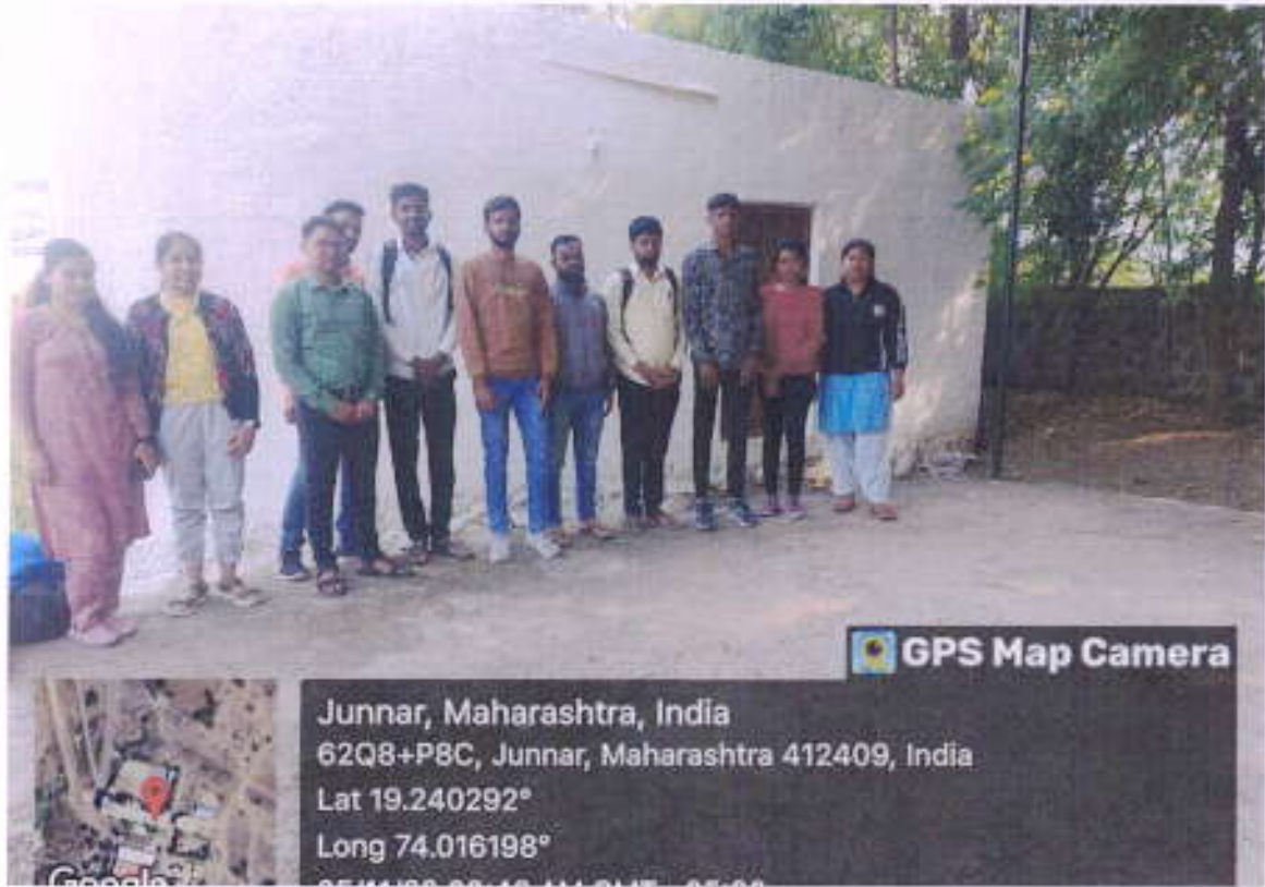
Visit to Yatin Arts Sculpture studio (Museum),