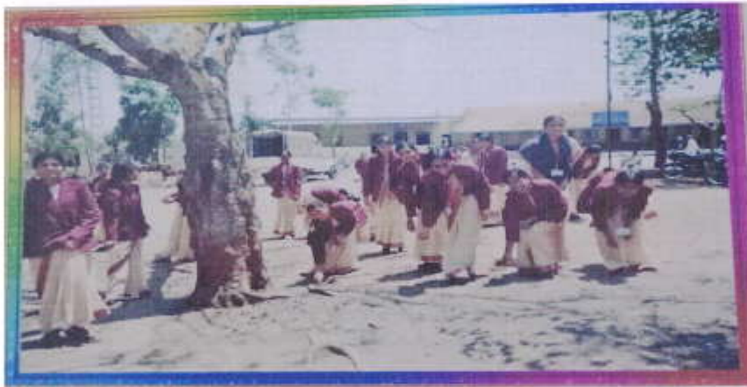
Gram Swacchata Campaign at Dumberwadi, Otur