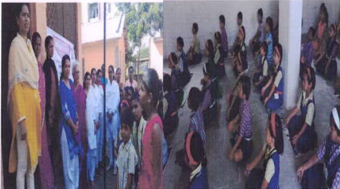
Yoga with Dumberwadi Primary School Children