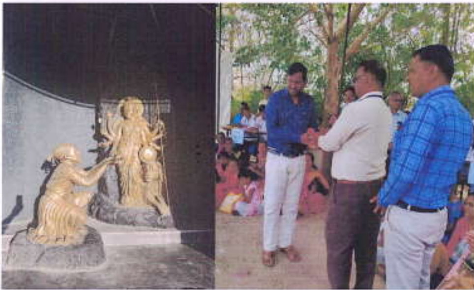
Visit to Yatin Arts Sculpture studio (Museum),