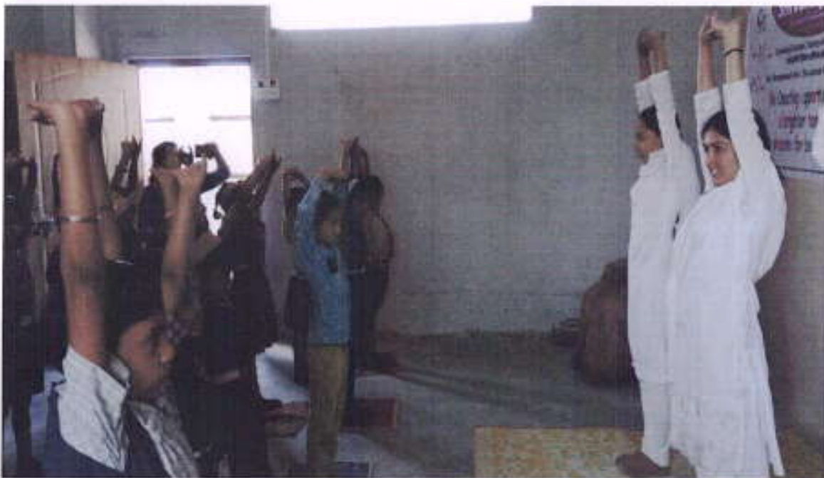
Yoga with Primary School Children