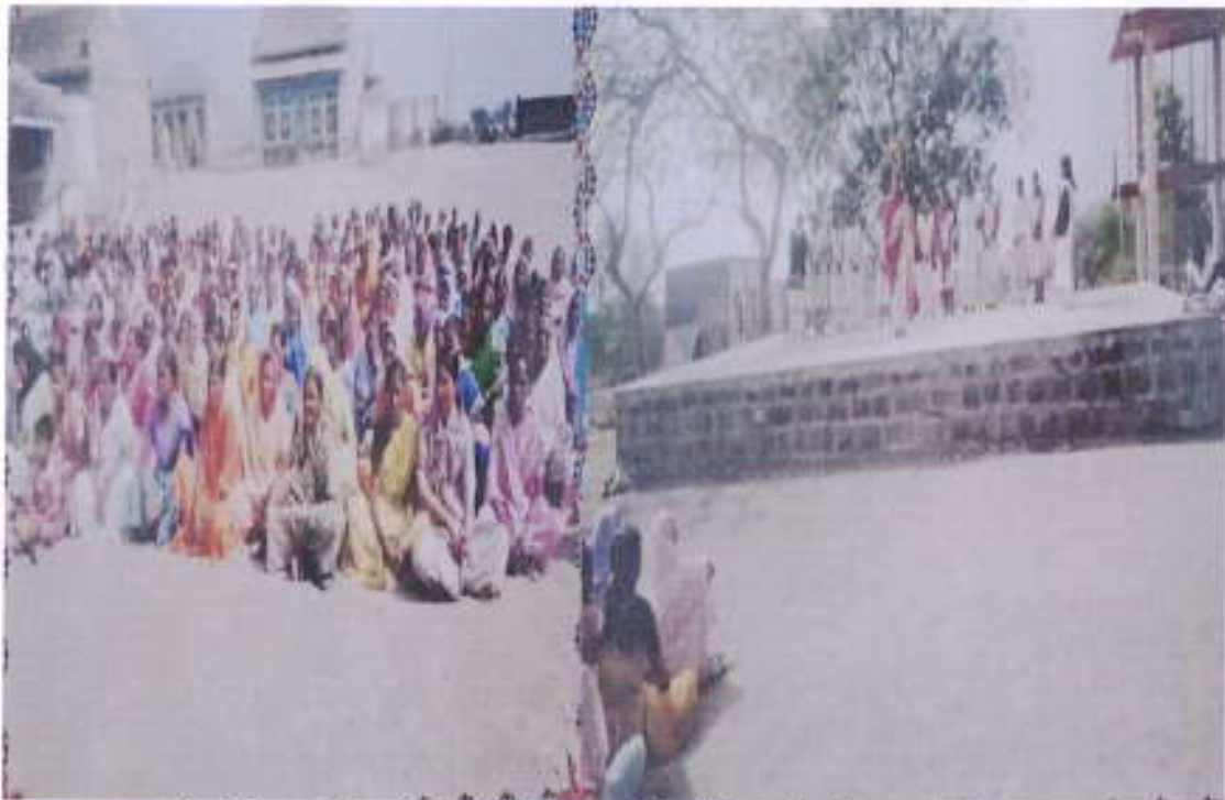
Health and hygiene Guidance For Female :Street play