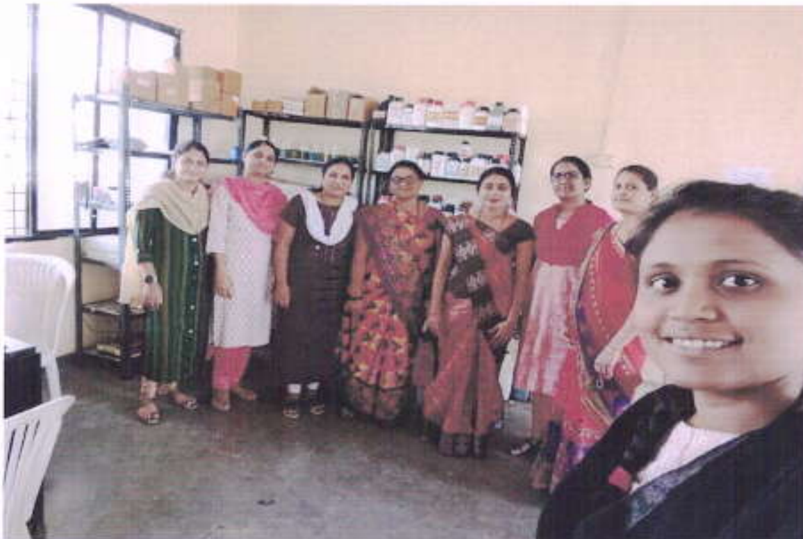
Visit to Pharmacy Lab