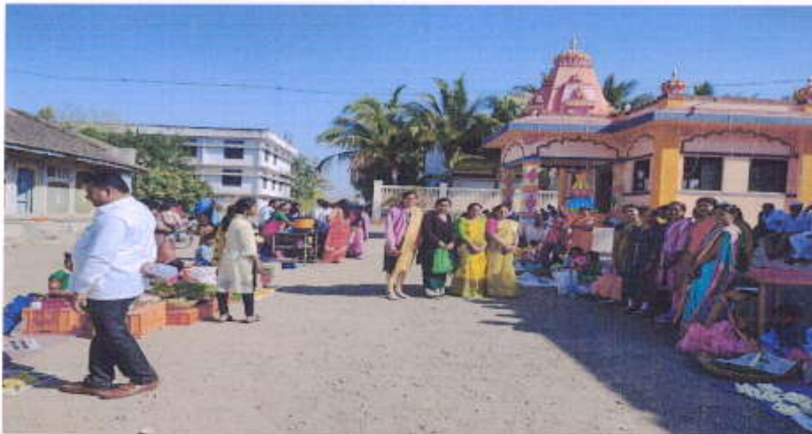
Anandmela in Dumberwadi