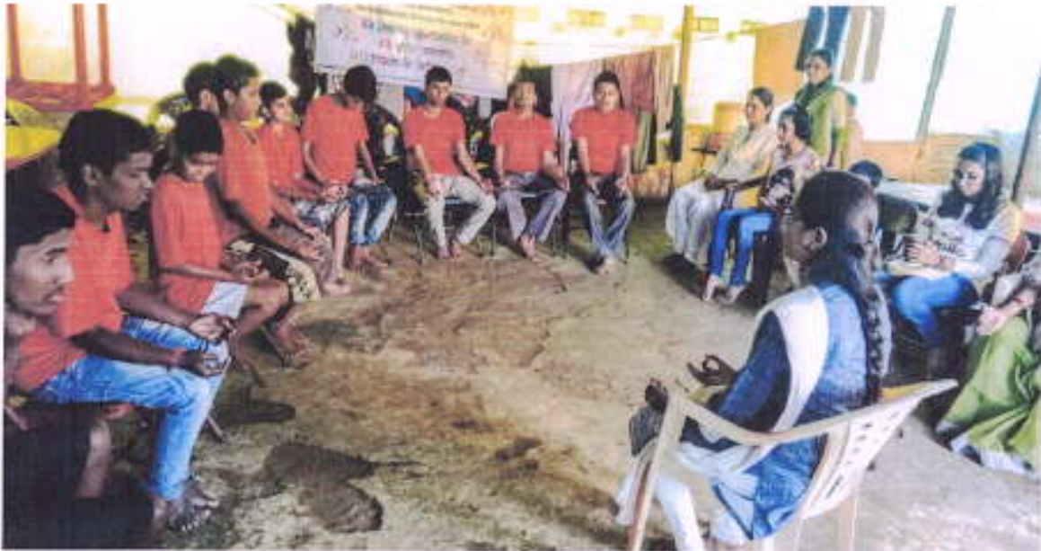
Visit to Special Children Institute