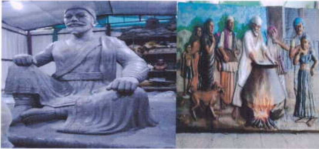
Visit to Yatin Arts Sculpture Studio Museum