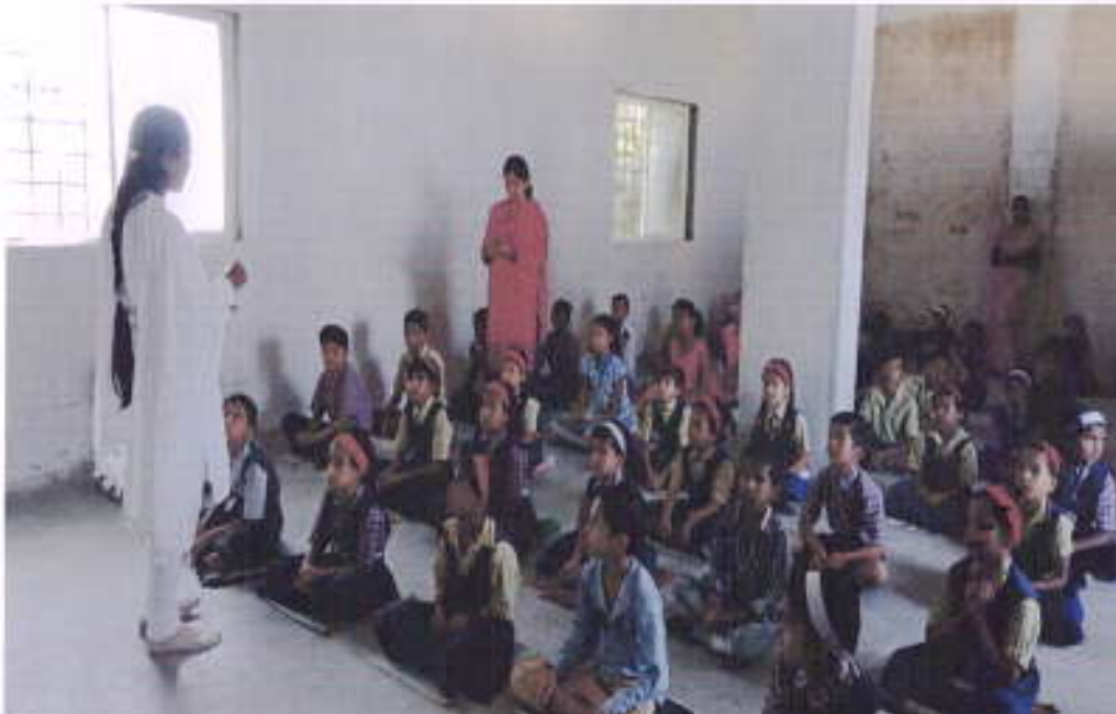
Health and Hygiene Guidance for Tribal Students