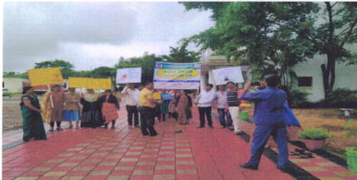
Health Awareness Rally