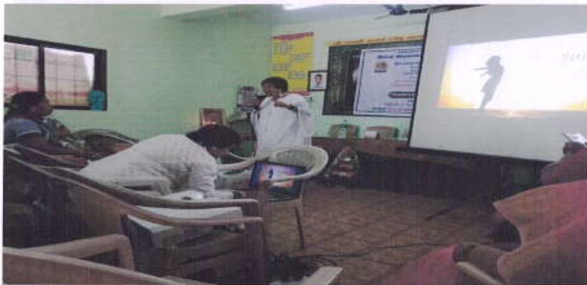
Self Defence program for girls

Shree Gajanan Maharaj Shikshan Prasarak Mandals VTWCOE organizes various workshops and training programs for students in this regard. VTWCOE organized a one day workshop on "Self Defence" at College Premises organized by Shivsanjivani Social Foundation. The resource-person for the day was sAdv.Sujata Kale .an enlightening one. Students actively participated in the program and learnt a lot through hands-on learning. Self Defence program lecture on 07/06/2020 College organized a highly effective Self Defence program in collaboration with Shivsanjivani Social Foundation.